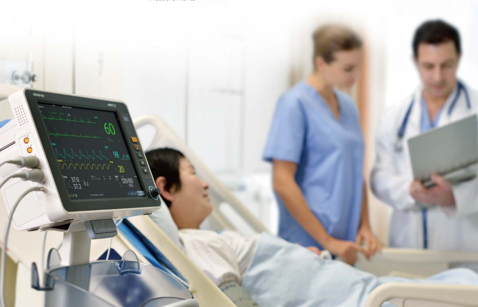
Long battery working time